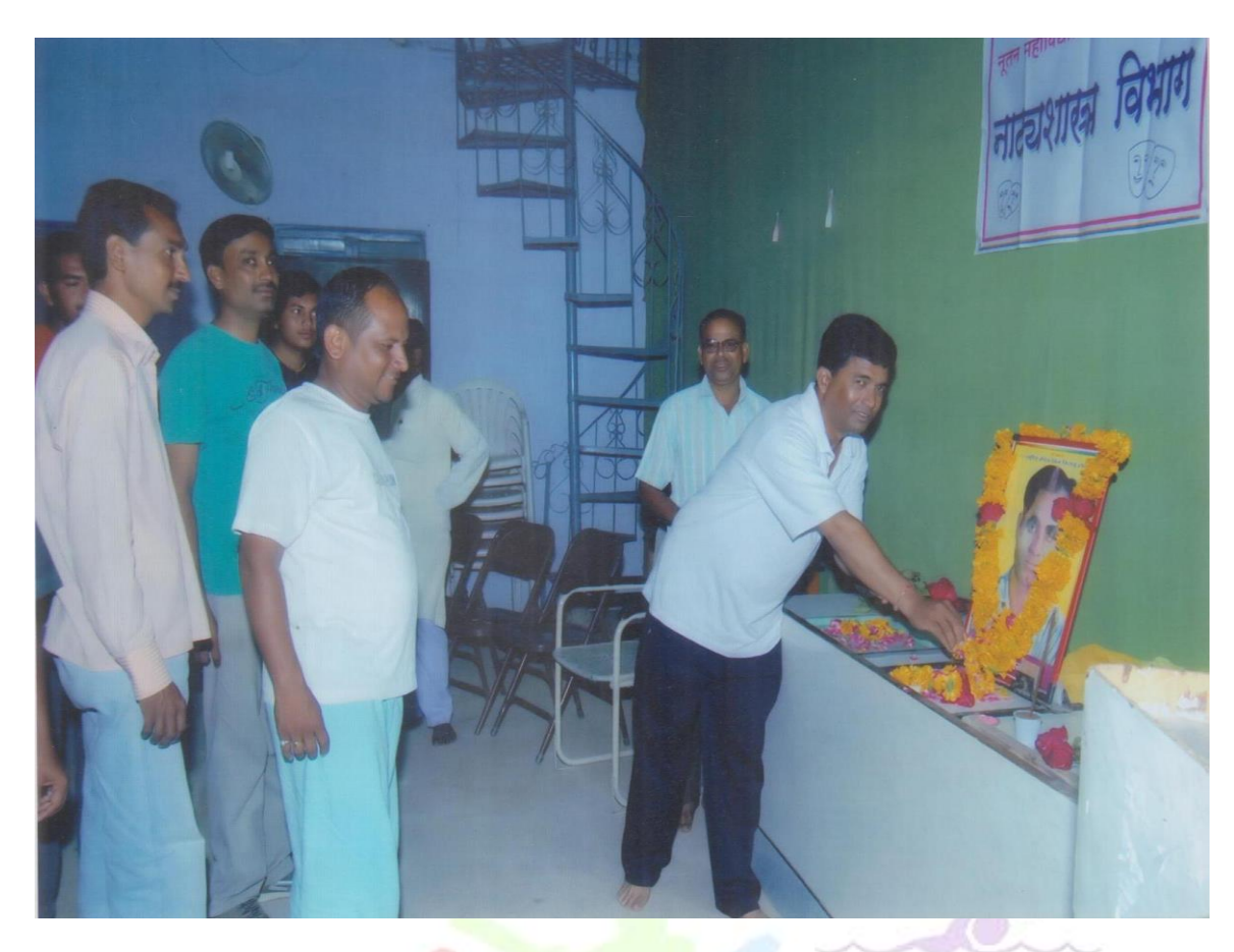
Celebration of Mejor Dhyanchand Jayanti on dated 29 Aug.