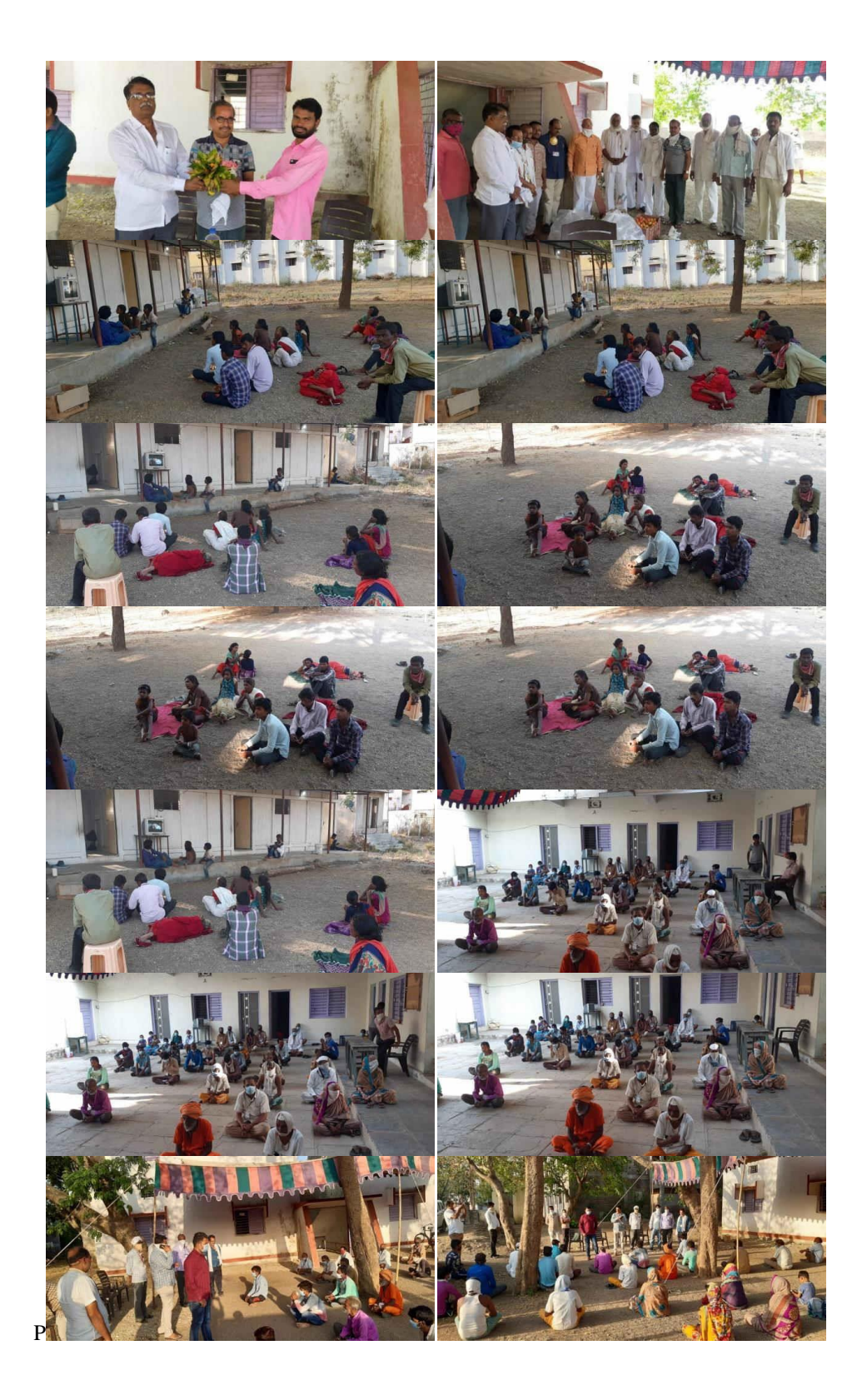
Photographs of Boys' Hostel (Migrate People Accomodation)